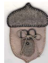
Acorn Feast—a wool kit Needle & Scissor case $35.95

Reminder to Garden Ball participants: First session is Monday, May 10th, 7:00 p.m. at my home.