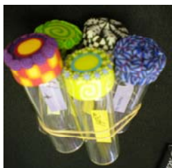
Needle Vials with Handmade tops $ 14.50