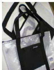
Mesh Tote Bag With handles—2 sizes $10.75 & $11.65