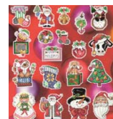
Christmas Ornaments $13.95