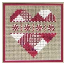
Peppermint Heart $ 6.50

Reads the same from left to right or right to left