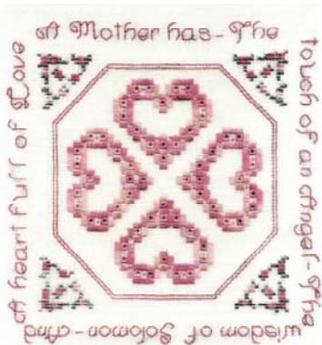
Mother (chart with silk floss) $21.50