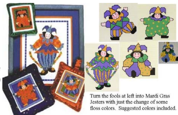
Turn the fools at left into Mardi Gras Jesters with just the change of some floss colors. Suggested colors included.

This is a chart I picked up at market, but I only purchased a few because I knew that it had potential, but that most stitchers would be daunted at changing the colors. I worked last weekend on suggested changes (which you can see at the far right) and have included these changes in the chart. This also would be a great project to stitch on a 10 count fabric—easy on the eyes and quick to accomplish. Check out our small “sitting fool” model in the shop.