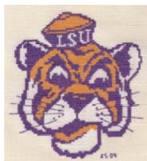
LSU's Old Mike New from Accents Inc (Item 1565L) $ 5.50