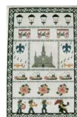
New Orleans Sampler by Home Sweet Home (Item 1641N) $ 7.00