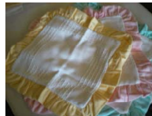
Premade pillows with Flannel ruffle. great baby gift- Clearance $12.50