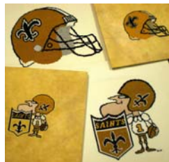
Saints Spirit 2 designs in 2 sizes (Item 1811S) $ 8.50