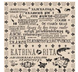
Louisiana Sampler approx. 28" square (Item 1271L) $ 22.00