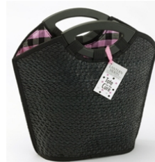
Tote for the Cure Handcrafted in Vietnam Special $25.95