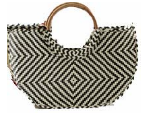
Tote #18011 Handcrafted in Vietnam Special $15.95