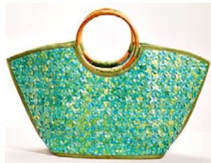
Green Tote #12927 Handcrafted in Vietnam Special $25.95