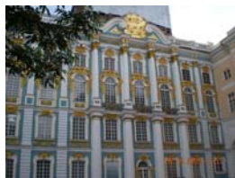
Catherine Palace in Russia