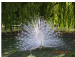
at Leeds Castle