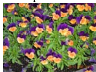
Geaux Tigers REALLY! Purple & gold pansies i