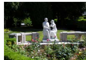
St Terese's childhood home in Lisieux