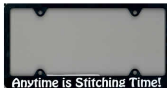
Stitching License Plates 3 styles available $6.50