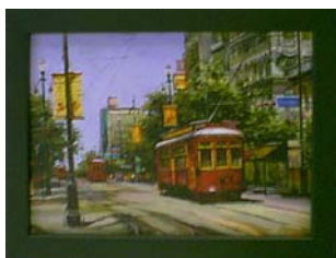
Misc. New Orleans scenes 6 x8 - $45 framed more choices available in shop