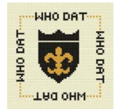
Who Dat It's The Dickens FREE to all who come in & ask now til 11/29/08

ACCENTS WILL BE CLOSED THURSDAY, NOVEMBER 27TH AND FRIDAY, NOVEMBER 28TH.