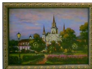
Misc. New Orleans scenes 6 x8 - $45 framed more choices available in shop