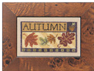
Little Bit of Autumn Erica Michaels (silk gauze) $15.50