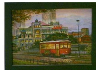
Misc. New Orleans scenes 6 x8 - $45 framed more choices available in shop

Your life is an open book – your every action is read by others. Make it an Inspirational manuscript!