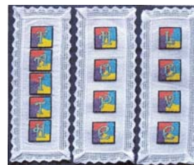
Faith Hope Love Olive Hope Designs $8.50