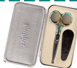
Roberta 4" Scissors Ginger collectibles $35.50