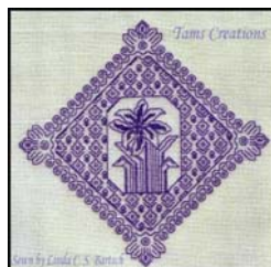
Blackwork Iris Tams Creations $6.50