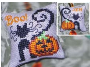
Halloween Kitty The Cat's Whiskers $ 4.00