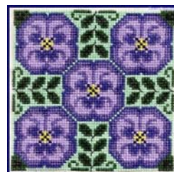
Alrescha Quilt Block Tams Creations $6.50

Your life is an open book – your every action is read by others. Make it an Inspirational manuscript!