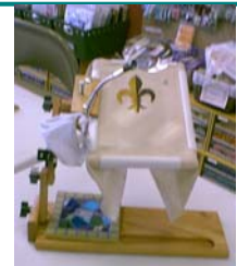
Z Frame K's Creations

Your life is an open book – your every action is read by others. Make it an Inspirational manuscript!